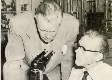
David Brian: Mr. D.A. seeks expert advice.

At this late stage, it would take a minor revolution to produce a revolutionary new crime show for TV. Thus, Mr. D.A. won't win any awards for originality. But thanks to some good writing, a fine star in the person of David Brian and excellent telefilm production and direction, the show can hold its own in any present TV company. It's straight fiction, but occasionally it captures a documentary flavor that builds extra excitement into the scripts. Other shows have re-